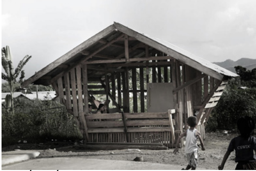
In the Philippines, a tambayan is a place to socialize and hang out. Shown here is a roofed bench version, with angled walls that anchor against strong winds while doubling as a back rest.

Leftover pavilion construction materials to be upcycled into the bench design are provided. The list of materials, as well as their specifications, can be downloaded from the OpenCall Materials link . Additional material may be used with justification.