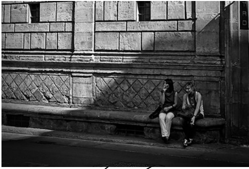
In Italy, benches grow out of building facades in a civic gesture that integrates public seating directly into the urban fabric, as in the Palazzo Rucellai in Florence by Leon Battista Alberti.

The open call invites design students from around the world to enter.