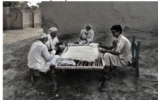
In Pakistan the Charpai is a hand-crafted object composed of natural materials, combining frame and weave, activating a spectrum of daily activities including play, conversation, and rest.