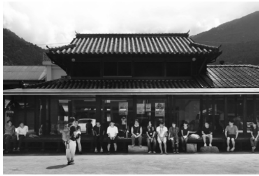
In Japan, The Engawa is a raised floor surface of a traditional Japanese house that faces outwards, doubling as a bench inviting passersby to rest at its periphery.

For any questions regarding your submission please contact us at: vbcc.opencall@gmail.com