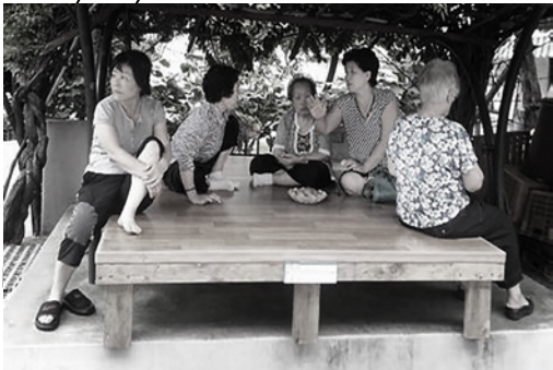
In Korea, the pyeongsang's sturdy wooden construction and generous dimensions serve as a communal sitting area, especially in the summer as it is cool, clean and elevated from the ground. It is a space where people share food and company, and even sleep. It is a place of intersection where people can intentionally interact with their neighbors.