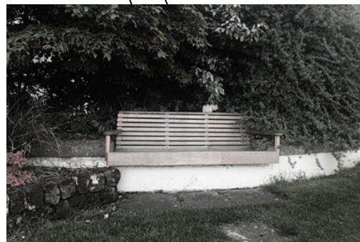
In Scotland, a public bench inserts itself into a private garden wall blurring the boundary between public and private.